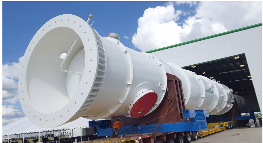
A large Air Products' custom designed coil wound heat exchanger.

For the AP-X® LNG Process, in addition to liquefaction process design and CWHEs (Coil Wound Heat Exchangers), Air Products designs and manufactures cryogenic nitrogen compressors (compressor turbo-expander machinery), and nitrogen economizer heat exchanger cold boxes.