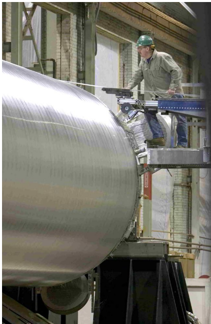
The bundle winding process for each coil wound heat exchanger manufactured by Air Products.